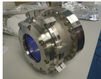
Viewport test assembly

ALBA Synchrotron and CLPU are the owners of the present invention and are offering it to the technological industries for its commercialization. Those companies interested, please, do not hesitate to contact the ALBA Industrial Liaison Office in the below email: